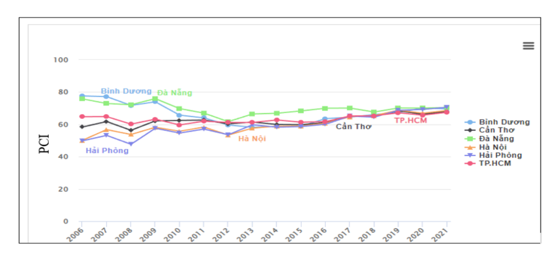
Chart 2: Provincial Competitive Index in Vietnam's six key cities

A strategic location, well-developed infrastructure, and strong business support policies have helped Da Nang remain at the top of the Provincial Competitive Index<sup>1</sup> (PCI) ranking. Da Nang was ranked fourth in 2021, above Hanoi and Ho Chi Minh City. It was ranked fifth for three consecutive years between 2018-2020, down from the second position in 2017, and its previous top ranking for four consecutive years from 2013 to 2016.