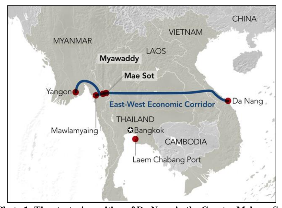
Photo 1: The strategic position of Da Nang in the Greater Mekong Subregion

Located in the middle of Vietnam's central region, 764 kilometers (km) from Hanoi and 964 km from Ho Chi Minh City, Da Nang is easily accessible to both international and domestic visitors thanks to its extensive transportation network by highway, railway, sea, and air. By land, Da Nang is connected to National Highway 1, North-South Expressway, and North-South National Railway. From Da Nang, tourists can access four famous United Nations Educational, Scientific, and Cultural Organization (UNESCO) World Cultural and Natural Heritage sites by road, including the Hue Ancient Citadel, Hoi An Ancient Town, My Son Sanctuary, and Phong Nha Caves. The La Son-Tuy Loan highway was recently completed in April 2022 and now provides an alternative route between Da Nang and Quang Ngai, the home of the Dung Quat Oil Refinery. Internationally, Da Nang links 13 major provinces of four countries including Myanmar, Thailand, Laos, and Vietnam through a 1,450 km highway system of the East-West Economic Corridor, a flagship initiative aimed at enhancing connectivity of the Greater Mekong Subregion's economies.