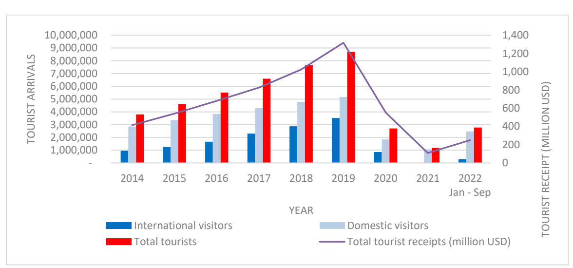
Chart 3: Tourist arrivals in Da Nang

Da Nang has already successfully positioned itself as a tourism destination. Prior to the COVID-19 pandemic, Da Nang witnessed a boom in tourism, with the total number of tourist arrivals more than tripling from 2.8 million in 2014 to a peak of 8.7 million in 2019. After two years of downturn and massive losses caused by the COVID-19 pandemic, Da Nang conducted a range of trade assistance promotions to revive its tourism industry. One solution was to host various international conferences and festivals to draw visitors into Da Nang, for instance, the Asia Routes Development Forum in June 2022, the Golf Tourism Festival, and the Asian Development Golf Tournament in September 2022. By successfully organizing the Asia Routes Development Forum, many international air carriers resumed direct flights to Da Nang, including from Malaysia, Korea, Thailand, Singapore, and Indonesia. Furthermore, the Vietnamese airline VietJet Air announced the opening of seven new direct flight routes connecting Da Nang with several cities of India, Korea, and Singapore.